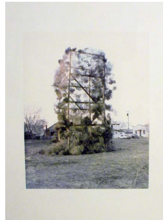
Tumbleweeds Catcher 1972