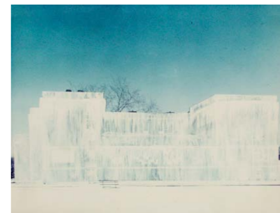
Ice House I 1971