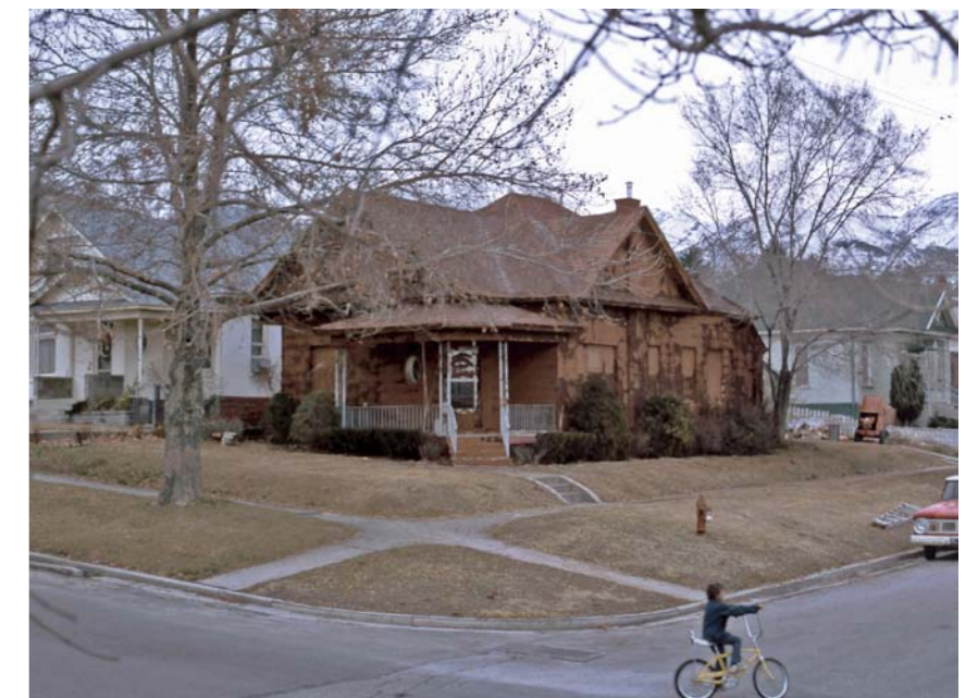
Clay House 1971

With the project, About Non-conscious Architecture , Gianni Pettena explores man's place in the apparently empty space of the deserts. An emptiness that is merely illusion for it is made up of natural monuments in dialog with the context.