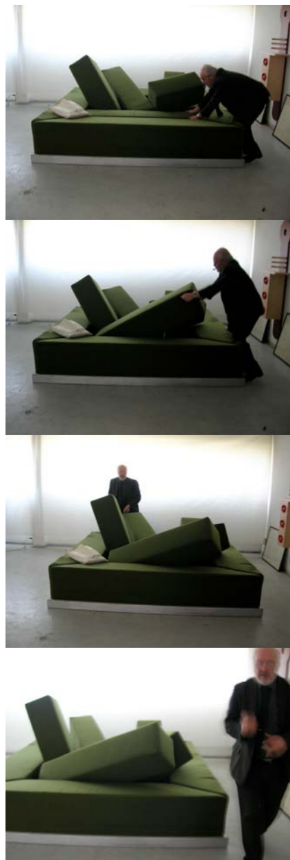
Rumble Sofa Gufram Edition 1967

The works of Gianni Pettena are at the confluence of art and architecture. He creates his own, different artistic languages ; according to him, it is necessary to work in parallel fields destined to transform space. Critic and teacher, he defines himself as an anarchist ( l'Anarchitetto , Editions Guaraldi, 1972). In the domain of « non-design », his interests turn to convertible structures. A good example is the Rumble (Edition Gufram, 1967), a large, multi-fonctional couch, a sort of micro-environment more adapted to the space it occupies than to human beings. A model of the Rumble will be exhibited along with the Babele (Edition Gufram, 1969), a table-sculpture with movable tops that makes reference to the primitive forms of a tree.