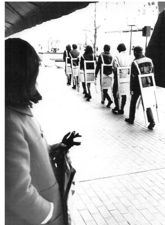
Wearable chairs 1971