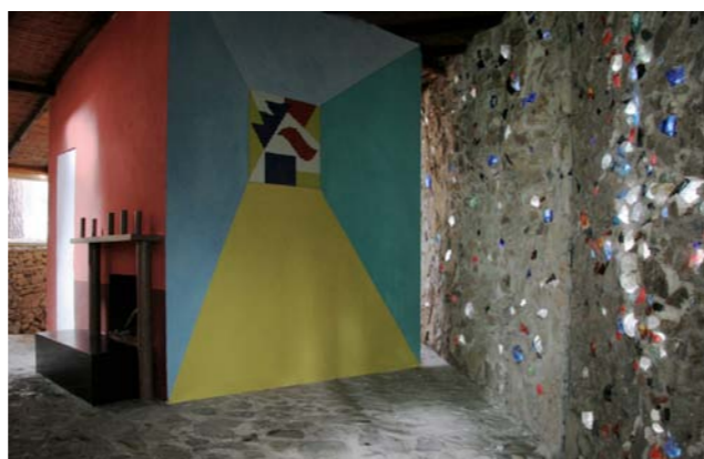
Maison Elba, outside and inside views 1975-2011